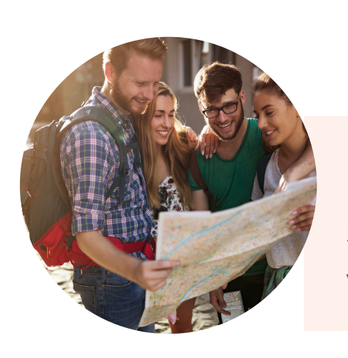
Urban escape game

Get into the training zone by pushing your limits and reaching a new level of fitness with your colleagues.